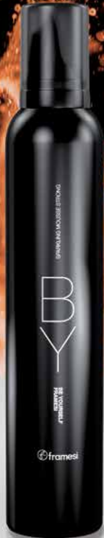
Sparkling Mousse Strong strong hold mousse