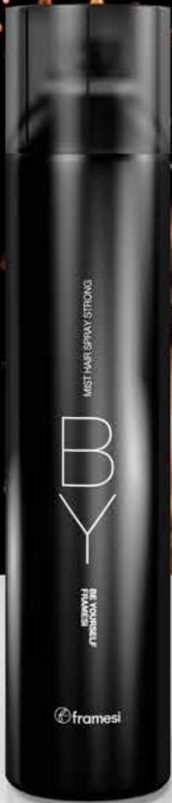
Mist Hair Spray Strong strong hold hair spray