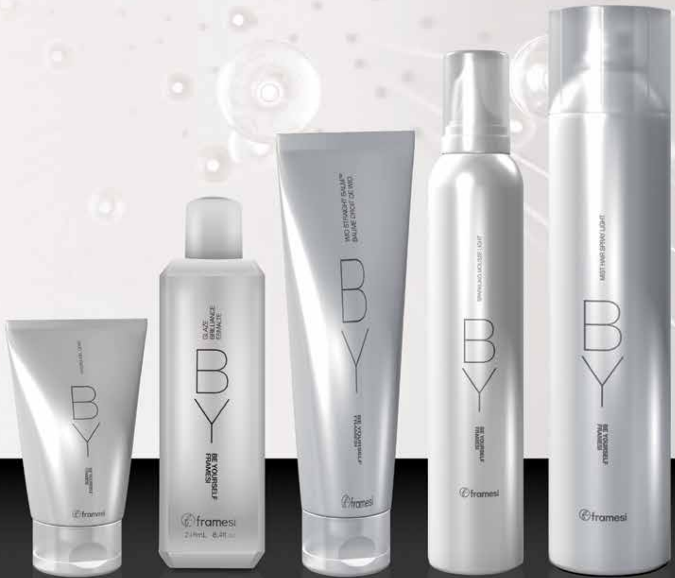
Hydro-Gel Light light hold gel