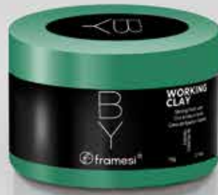
Working Clay matte sculpting wax