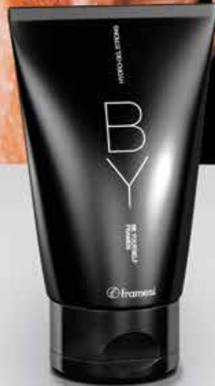
Hydro-Gel Strong strong hold gel