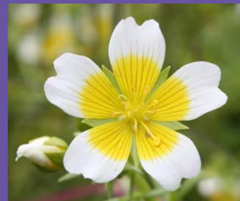
MEADOWFOAM SEED OIL