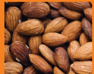
SWEET ALMOND OIL