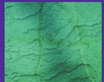
BLUE GREEN SPIRULINA