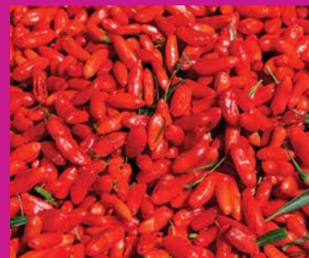
LYCIUM CHINESE FRUIT