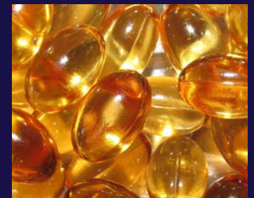
NATURAL OILS & VITAMINS