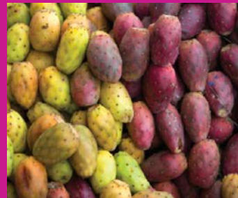
PRICKLY PEAR FRUIT