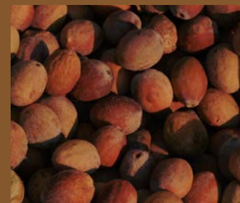
MANKETTI KERNEL OIL