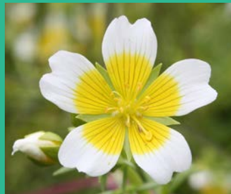
MEADOWFOAM SEED OIL