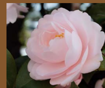
CAMELLIA SEED OIL