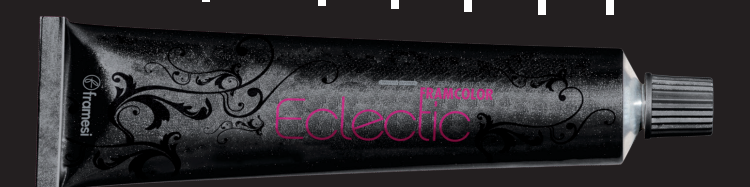
Framcolor Eclectic tube is marked in sixths.

1/6 10cc 1/6 10cc 1/6 10cc 1/6 10cc 1/6 10cc 1/6 10cc