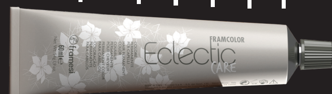
Framcolor Eclectic CARE tube is marked in sixths.

1/6 10cc 1/6 10cc 1/6 10cc 1/6 10cc 1/6 10cc 1/6 10cc